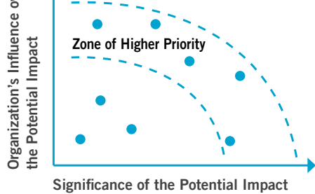
Figure 1: Prioritization of climate-related risks to a Certified Organization based on the significance of the potential impact and the organization's ability to influence the risks.

can then be distilled into a short list of topics that inform forest management strategies, targets, operations, and reporting 8 . Determining which risks and vulnerabilities are the highest priority may involve considering the nature of the impacts, including whether they are positive or negative, actual or potential, direct or indirect, short-term or long-term , or intended or unintended. A further consideration may be given to the significance of the potential impact on the Certified Organization , its operations, and stakeholders , and the level to which the impact can be influenced (Figure 1), and the risks over the long-term planning horizon for the forest being assessed.