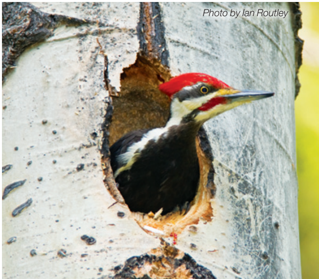
Forest certification protects critical habitats.

It's worth noting that wood is the only building material that has third-party certification programs in place to verify that products originate from responsibly managed sources.