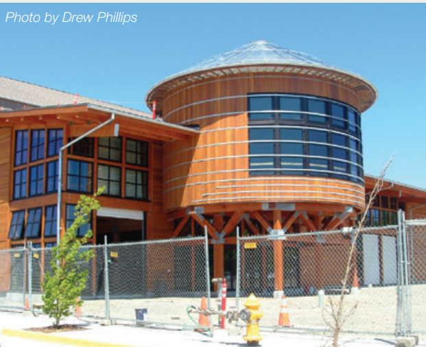
Olympia Children's Museum

The Children's Museum in Olympia, Washington, is involved in a 28,000-square-foot expansion project that will double its space and confirm its commitment to green building. The facility is on track for LEED Silver recognition and is pursuing Green Globes certification. As part of the museum's sustainable building