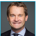
THE HONOURABLE SEAMUS O'REGAN MINISTER NATURAL RESOURCES CANADA