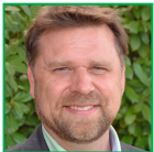
CHRIS FRENCH ACTING DEPUTY UNDERSECRETARY FOR NATURAL RESOURCES AND THE ENVIRONMENT U.S. DEPARTMENT OF AGRICULTURE