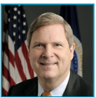
THE HONORABLE THOMAS J VILSACK SECRETARY U.S. DEPARTMENT OF AGRICULTURE