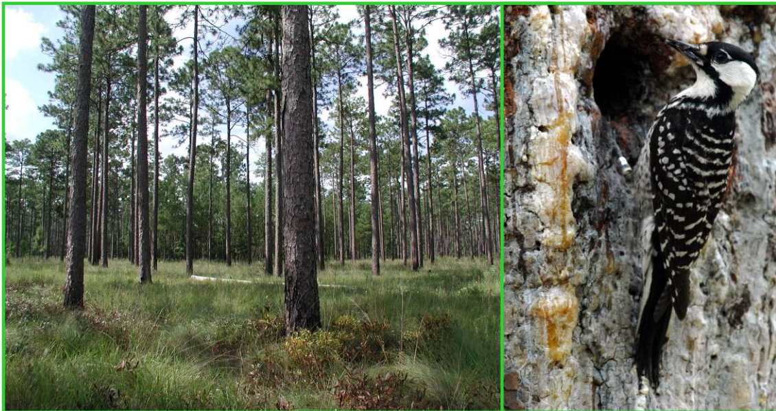
Brosnan Forest protects long leaf pine stands (on left) – important habitat for the Red-cockaded Woodpecker (on right).

Brosnan Forest is rich habitat for Red-cockaded Woodpeckers because of Norfolk Southern’s long-term management of the forest for quail hunting. To manage the forests for wildlife, Norfolk Southern has been enhancing the habitat through a combination of selective thinning of mature timber and controlled burning of the herbaceous vegetation for 50 years. Hunting leases are operating on about 300 acres of Brosnan Forest and bring in about $3,600 per year. Norfolk Southern also sustainably manages timber on all of the property and recently had the property certified under the Sustainable Forestry Initiative (SFI) program.